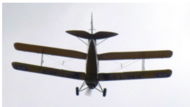
Strafing Run on the day by a Sopwith Camel

Peter was the first on air operating 2m FM whilst the others three of us were busy setting up the HF station and, more importantly, getting the kettle on. Regrettably we were not able to operate indoors although there appeared to be space for us in two or three areas which had power. We operated outside in the cold without protection from the weather. Fortunately it did not rain but there was a decided chill in the air.