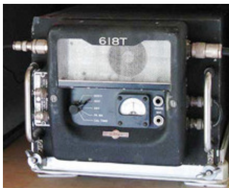
Collins 618T Transmitter on 7 MHz

An interesting element of this event was the use of vintage aircraft equipment on the bands. For example, the club worked a station using a Collins 618T aircraft transmitter that