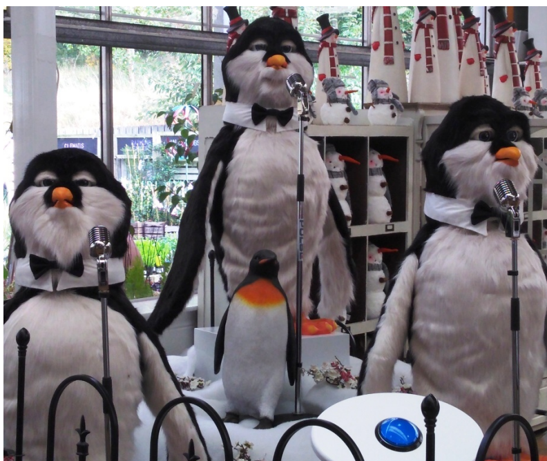
Singing Penguins - Press the Button and Cringe