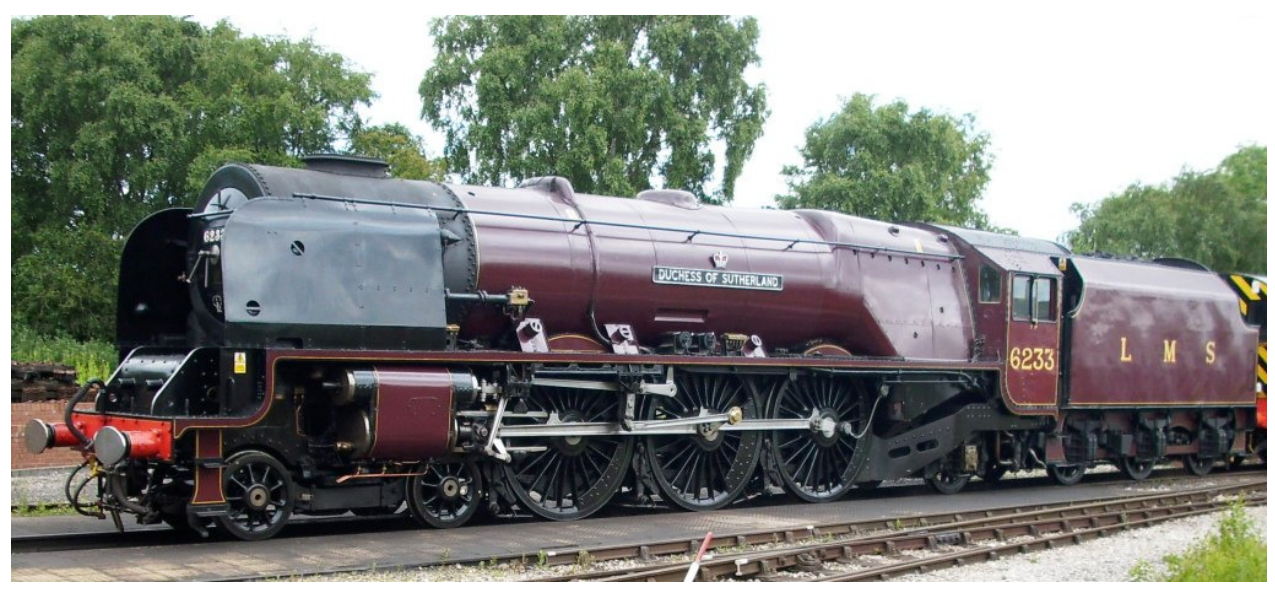
Nice Photograph of the Duchess of Sutherland (West Shed)

we had a pile-up which stayed all day, working about 100 or so until we had to close down at 16:17 to give us time to de-rig and stack gear outside ready to load into the car. We'd worked a further 5 or 6 RotA stations too which was good. Signals generally were much better than the Saturday with a majority of them being 59+ or even 59++ on our Society's FT897 which was run at 100W. Regrettably there seemed to be many stations who we just couldn't get around to contacting, such is the penalty of operating in a welcoming location (the duty volunteers keeping our back teeth awash with copious amounts of tea all the time we were there!) which doesn't open until 10:00 and closes at 16:30. Hopefully we'll do even better next year.